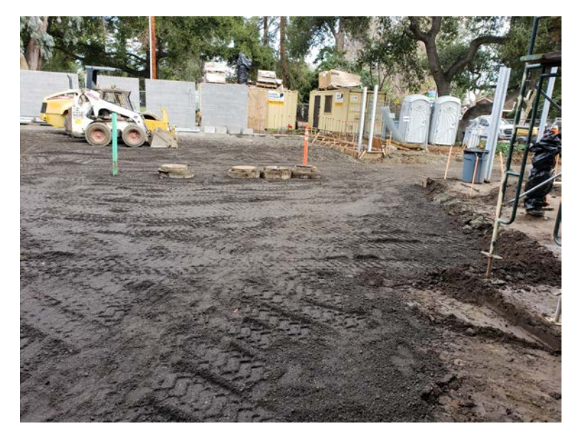
Grading of back parking lot.