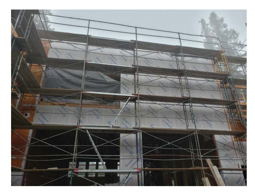
Exterior waterproofing install with scaffolding.