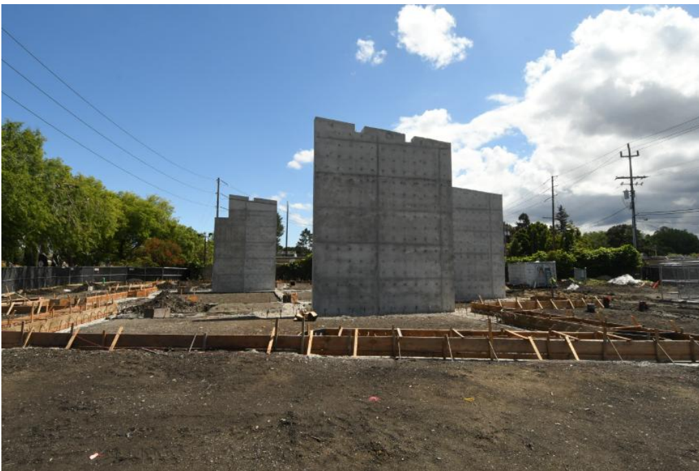
Completed concrete shear walls