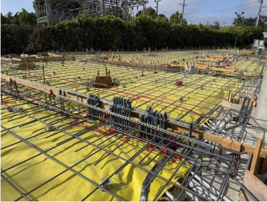
Concrete slab reinforcement