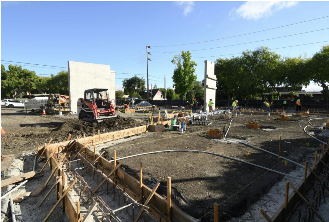
Under slab utility installation