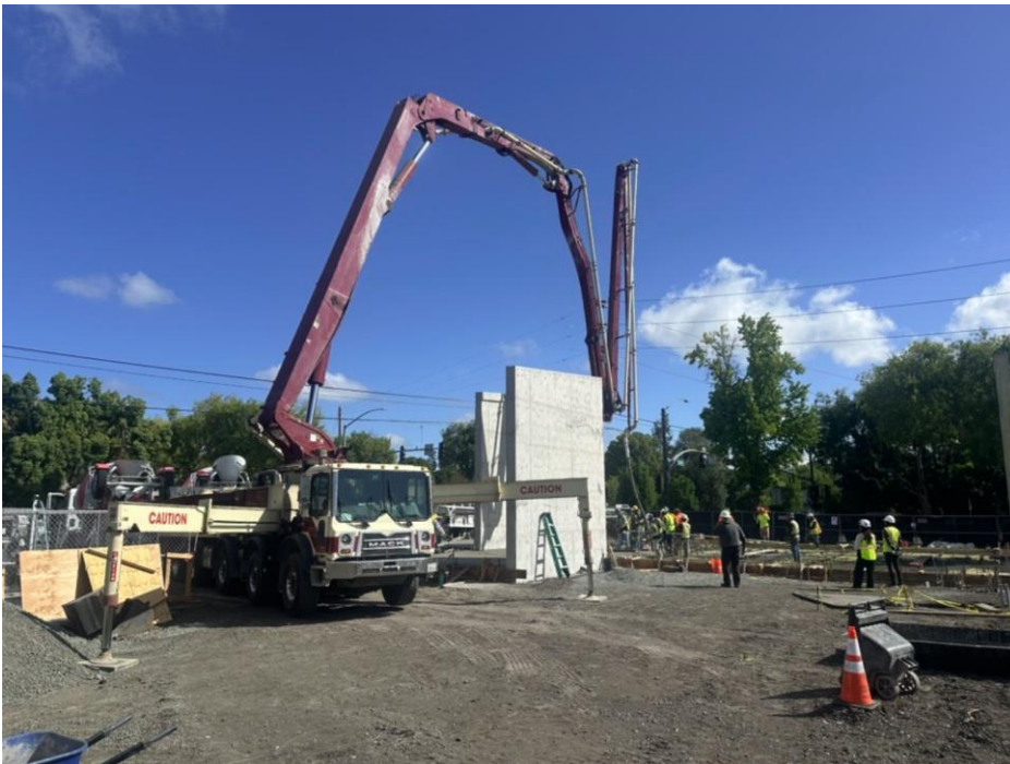
Concrete slab pour