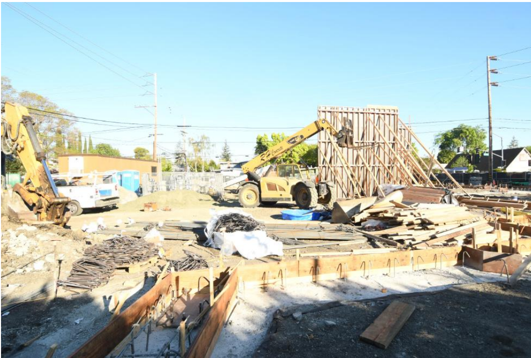
Concrete shear wall forms